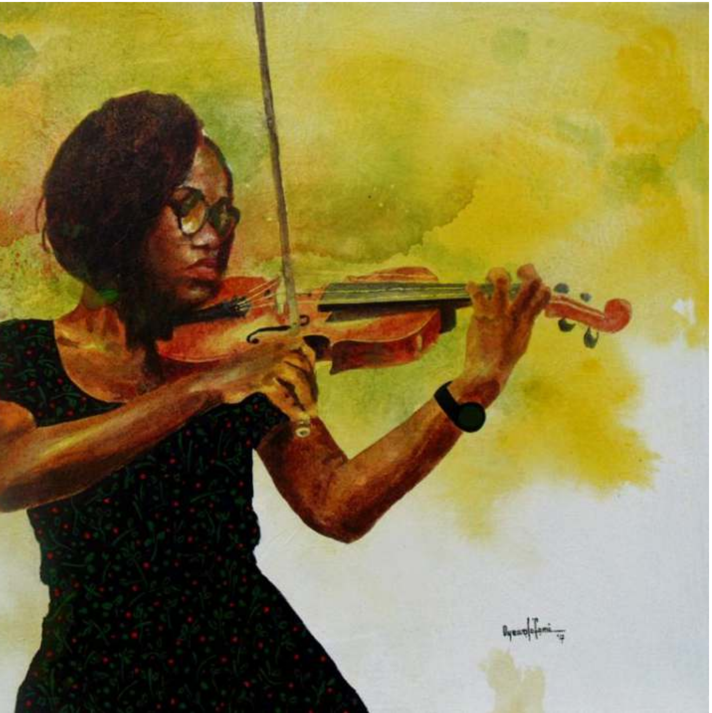
FOURTH ON A / 30 x 40 inches, acrylic on canvas, 2017