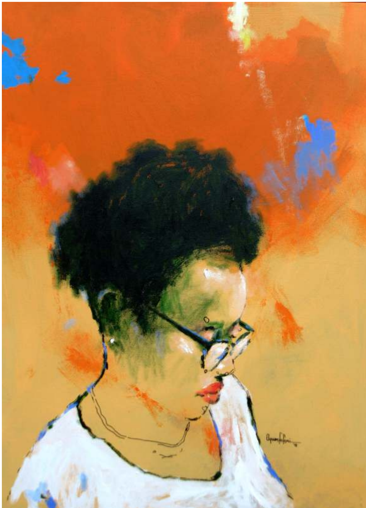
VACILLATING / 40 x 30 inches, acrylic on canvas, 2017