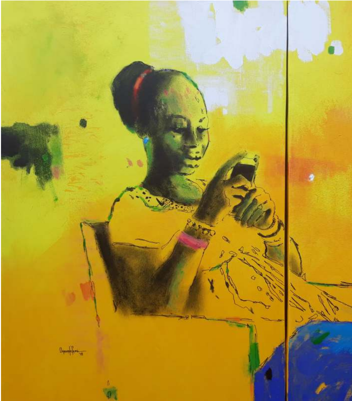
TRENDING / 24 x 72 inches (Diptych), acrylic on canvas, 2018