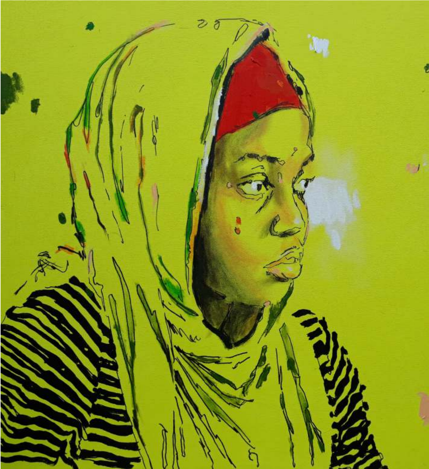
THE SEER / 30 x 40 inches, acrylic on canvas, 2018