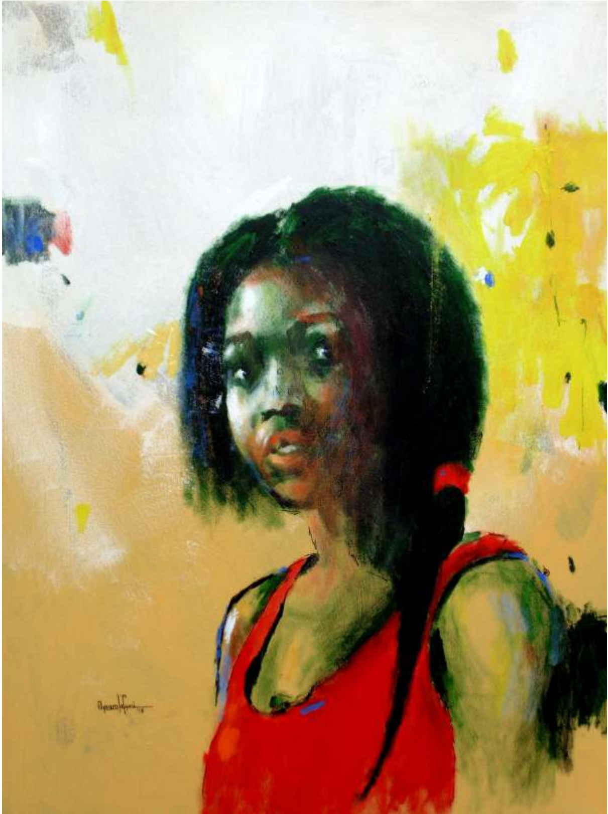
UNDAUNTED (2) / 40 x 30 inches, acrylic on canvas, 2018