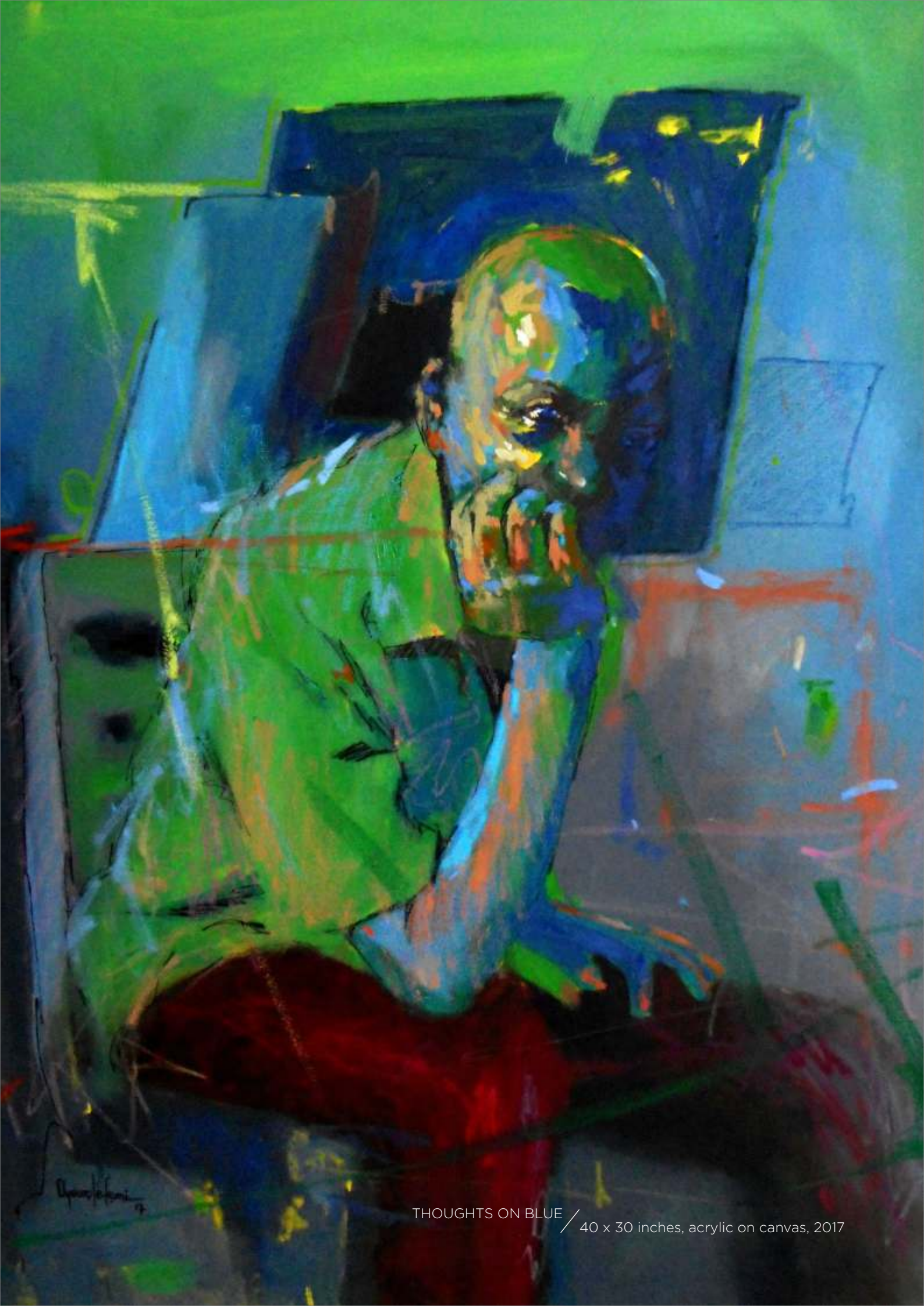
THOUGHTS ON BLUE / 40 x 30 inches, acrylic on canvas, 2017