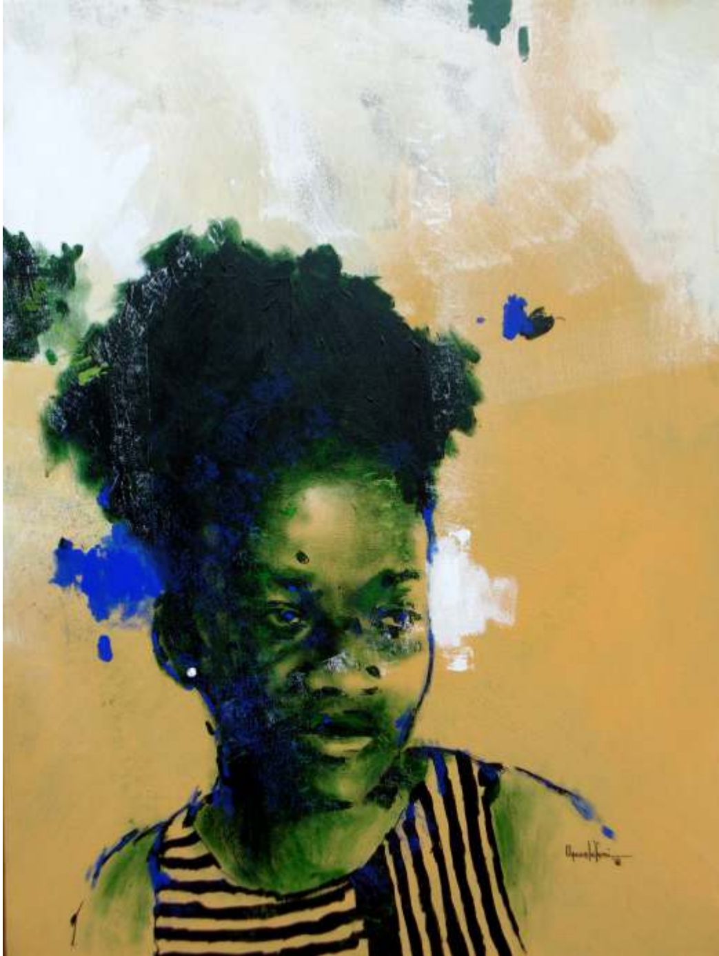
UNDAUNTED (1) / 40 x 30 inches, acrylic on canvas, 2018