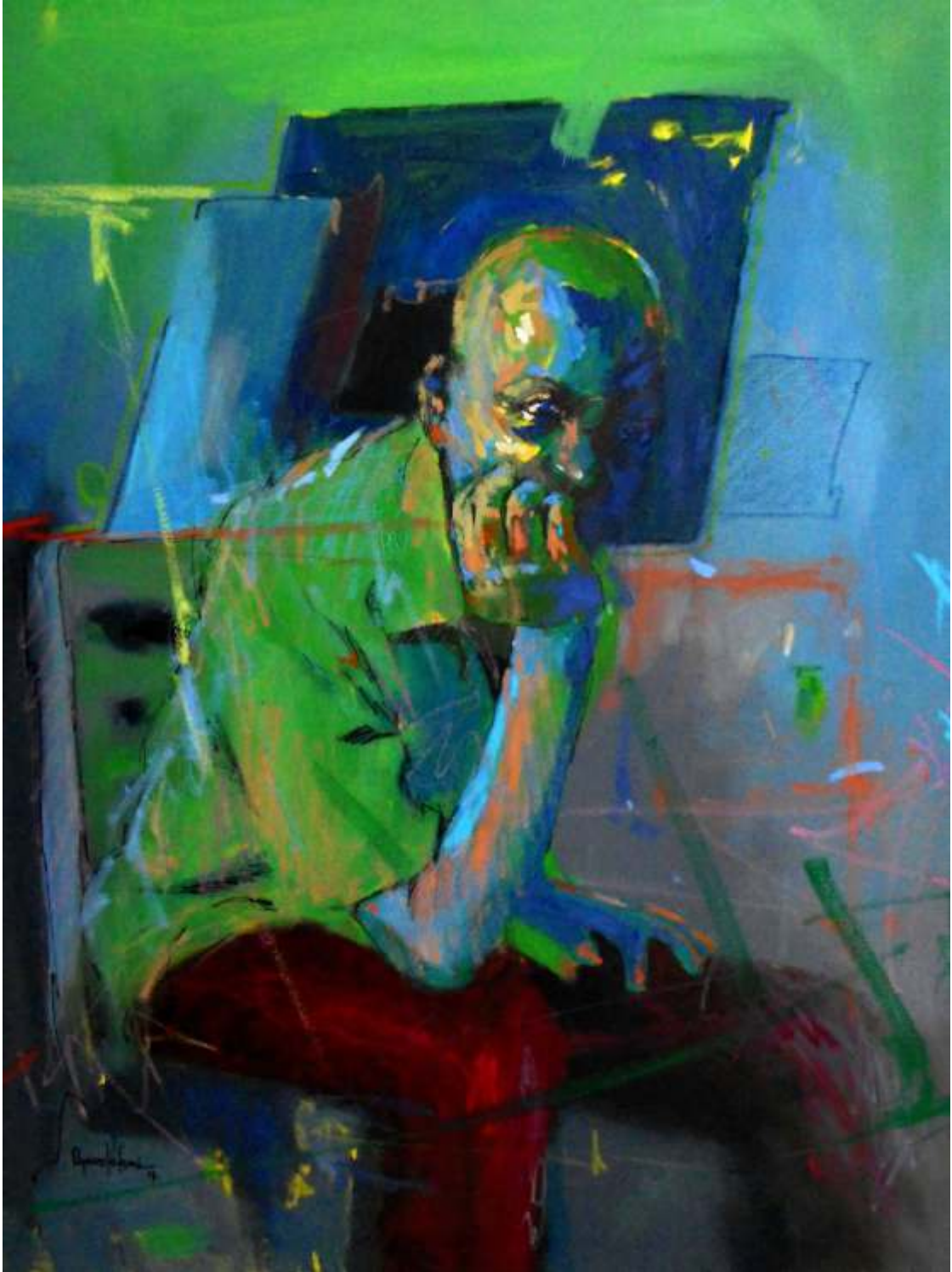
THOUGHTS ON BLUE / 40 x 30 inches, acrylic on canvas, 2017