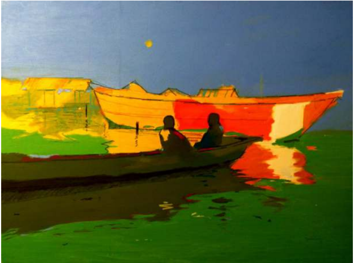
BESIDE THE GREEN WATERS / 36 x 48 inches, acrylic on canvas, 2017