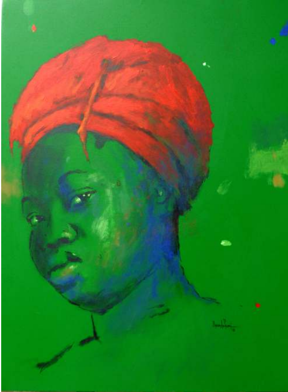
THE OBSTINATE LOOK / 40 x 30 inches, acrylic on canvas, 2018