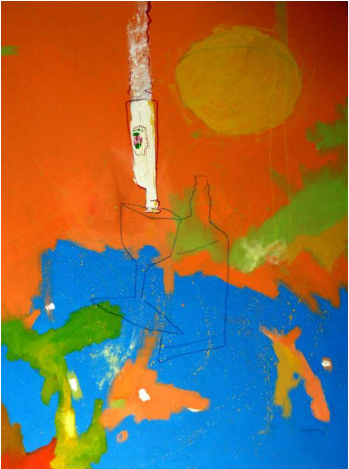
LUNCHEON / 48 x 36 inches, acrylic on canvas, 2017