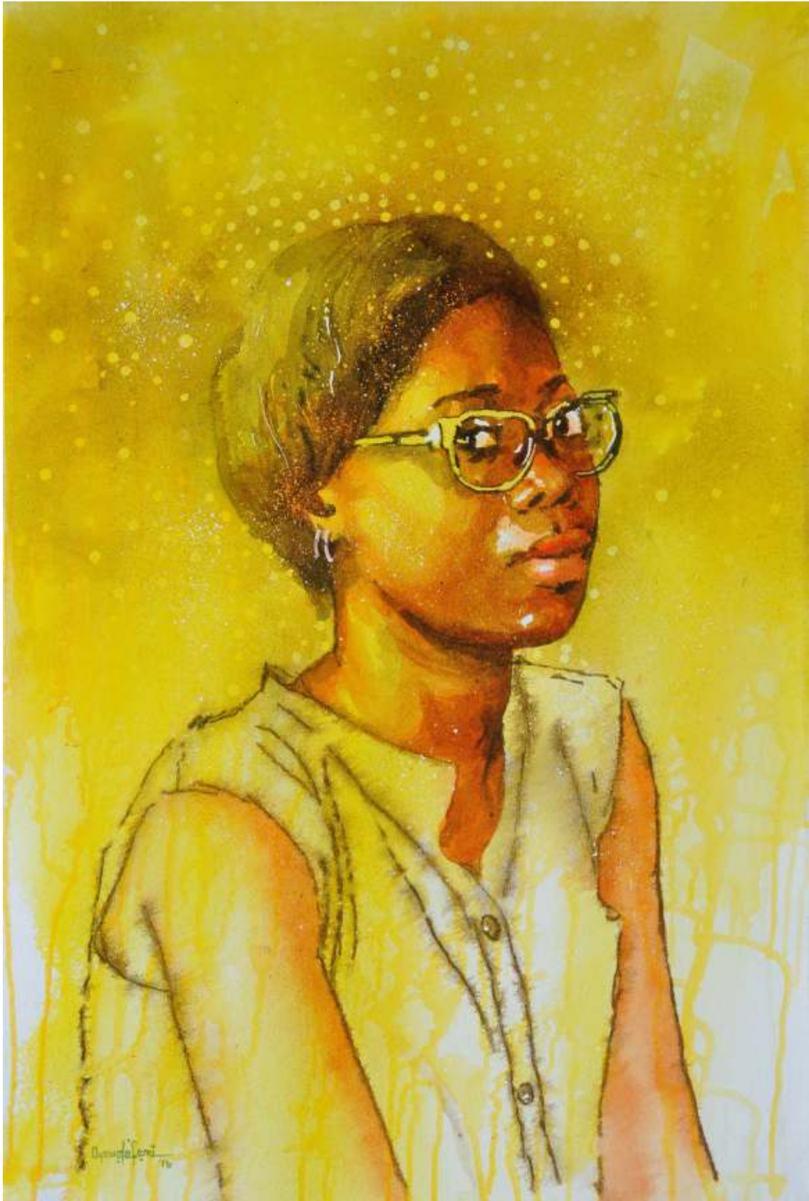
YELLOW CRUSH / 36 x 24 inches, acrylic on canvas, 2017