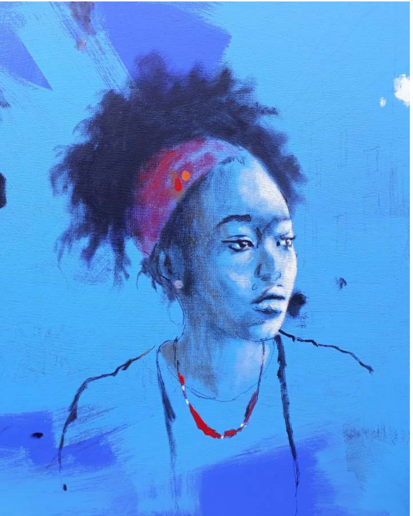
GOING BLUE / 24 x 36 inches, acrylic on canvas, 2017