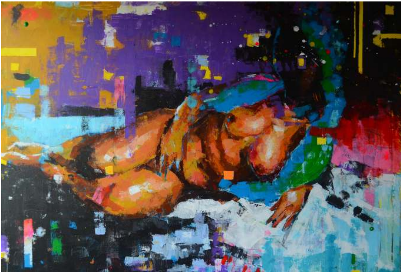
CAREFREE BEAUTY III / Acrylic on canvas, 36 x 48 inches, 2019