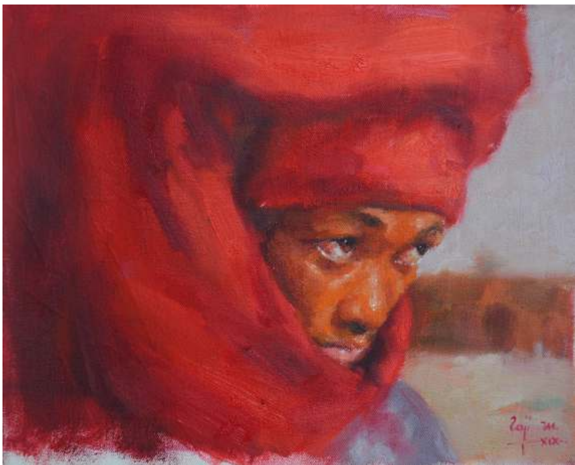
RED FIXATION II / Oil on canvas, 9.5 x 12 inches, 2019 '