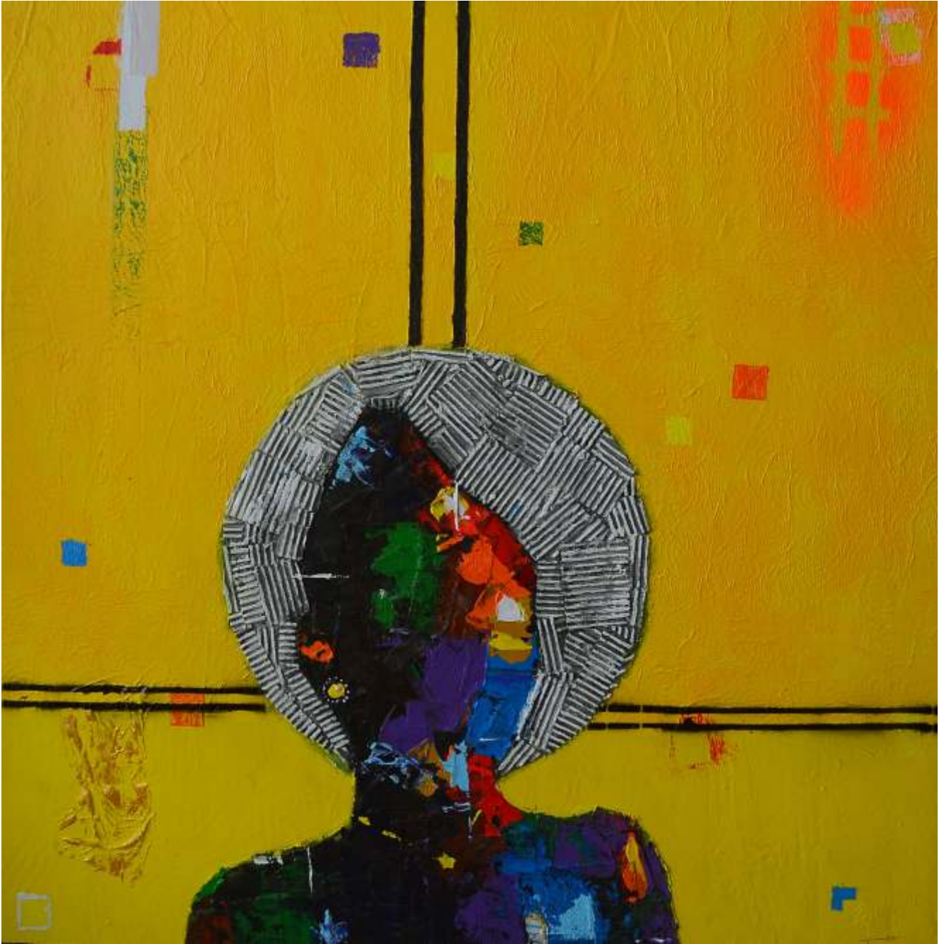
THE HUB I / Acrylic on textured canvas, 36 x 36 inches, 2019