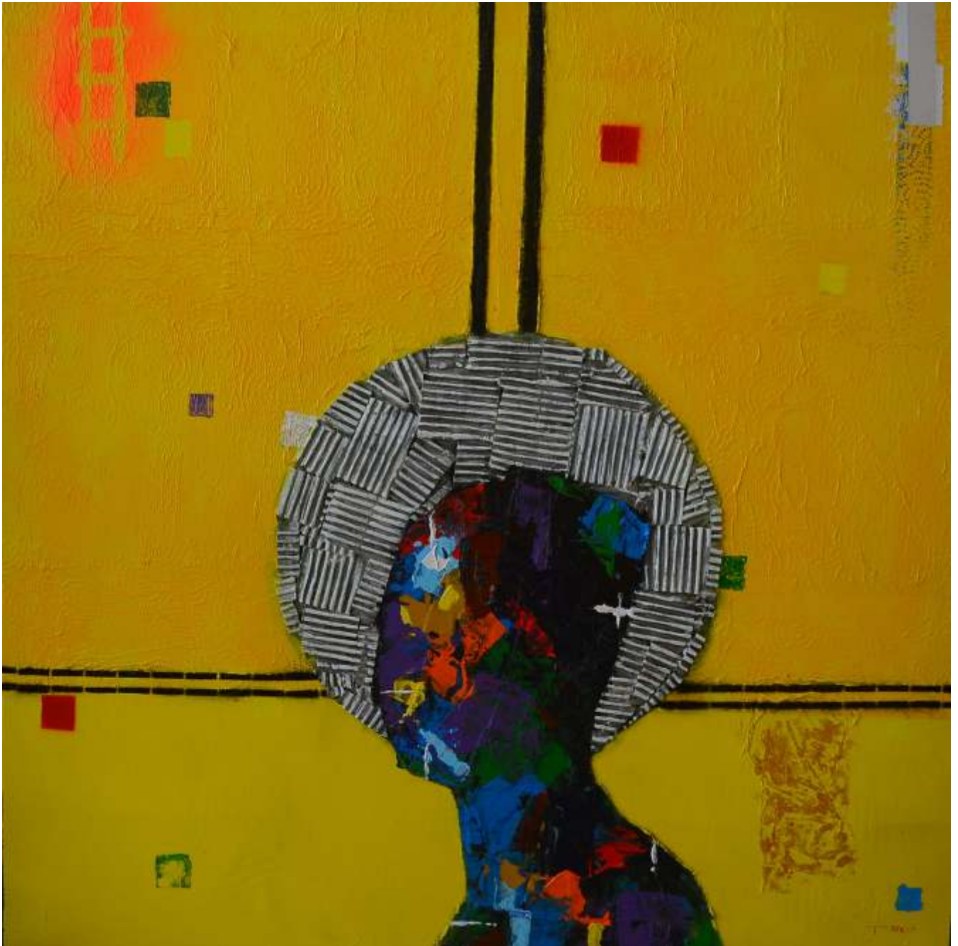
THE HUB II / Acrylic on textured canvas, 36 x 36 inches, 2019