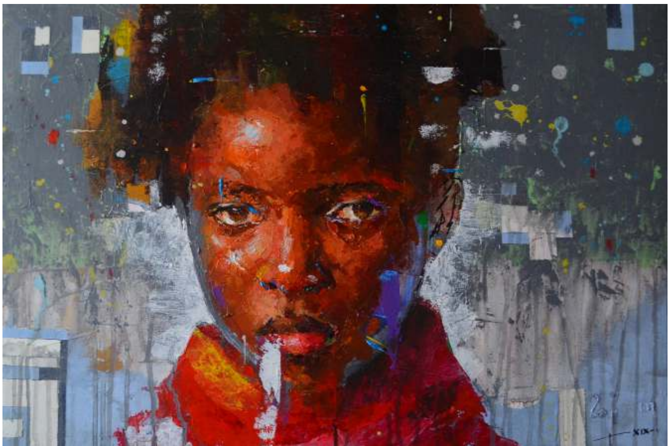
BETTY'S MIND / Acrylic on canvas, 16 x 24 inches, 2019