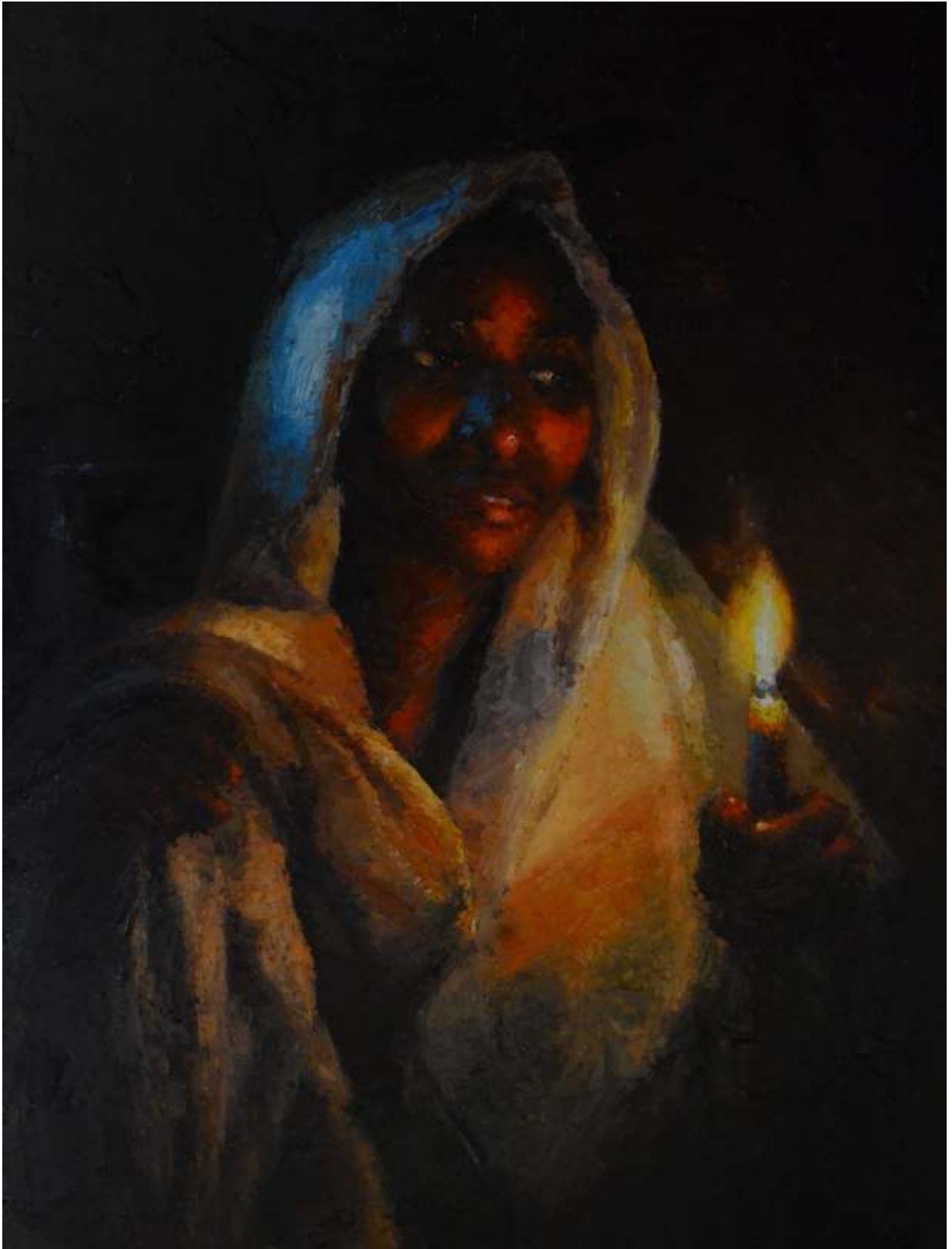
LITTLE LIGHT OF MINE II / Oil on canvas, 14 x 18 inches, 2019