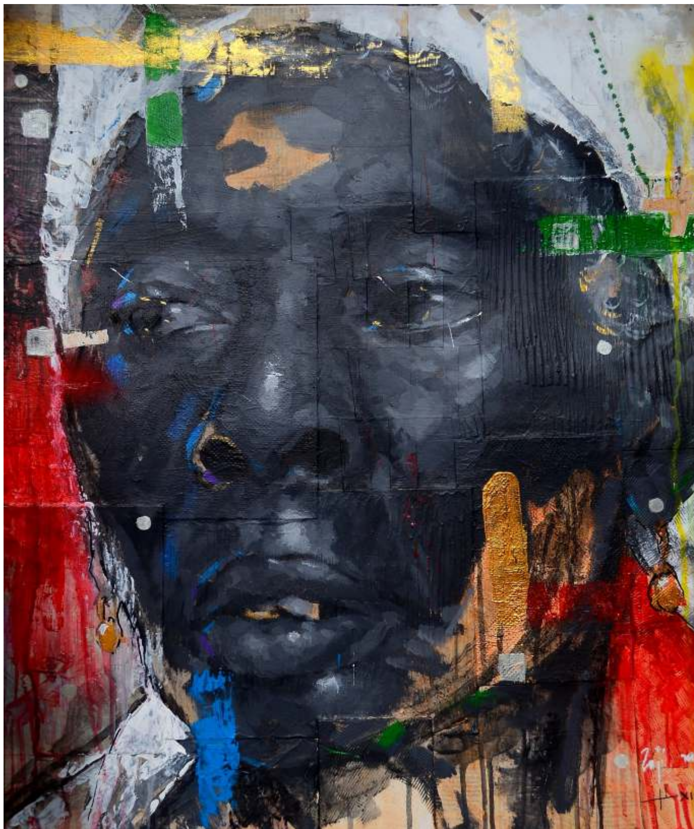
GOLDEN MEMORIES / Acrylic on textured mountboard, 24 x 28 inches, 2019