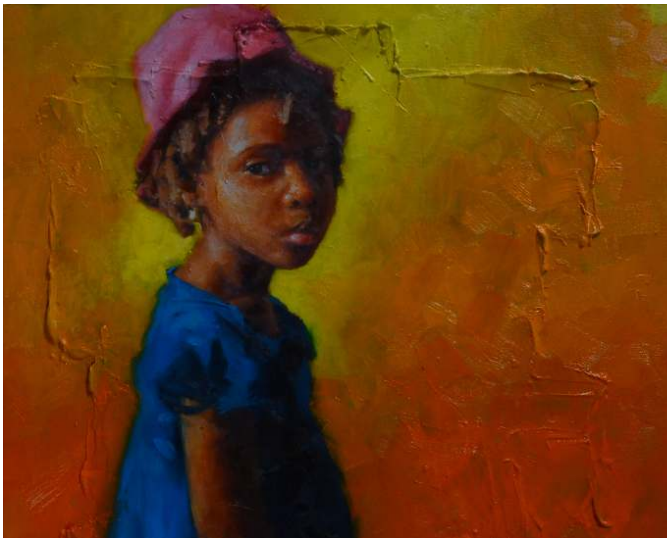
TENDER ANTICIPATION IV / Oil on textured canvas, 22 x 18 inches, 2019