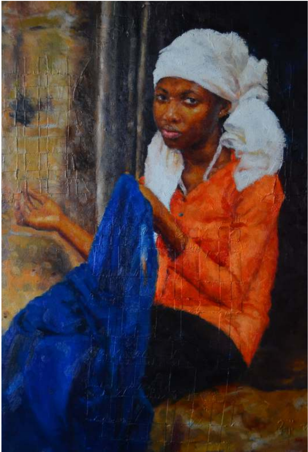
THE SEAMSTRESS / Oil on woven canvas, 24 x 33 inches, 2019