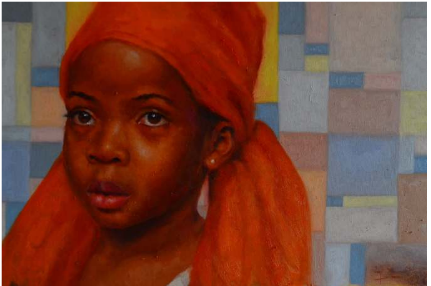
ANTICIPATION / Oil on canvas, 16 x 24 inches, 2018