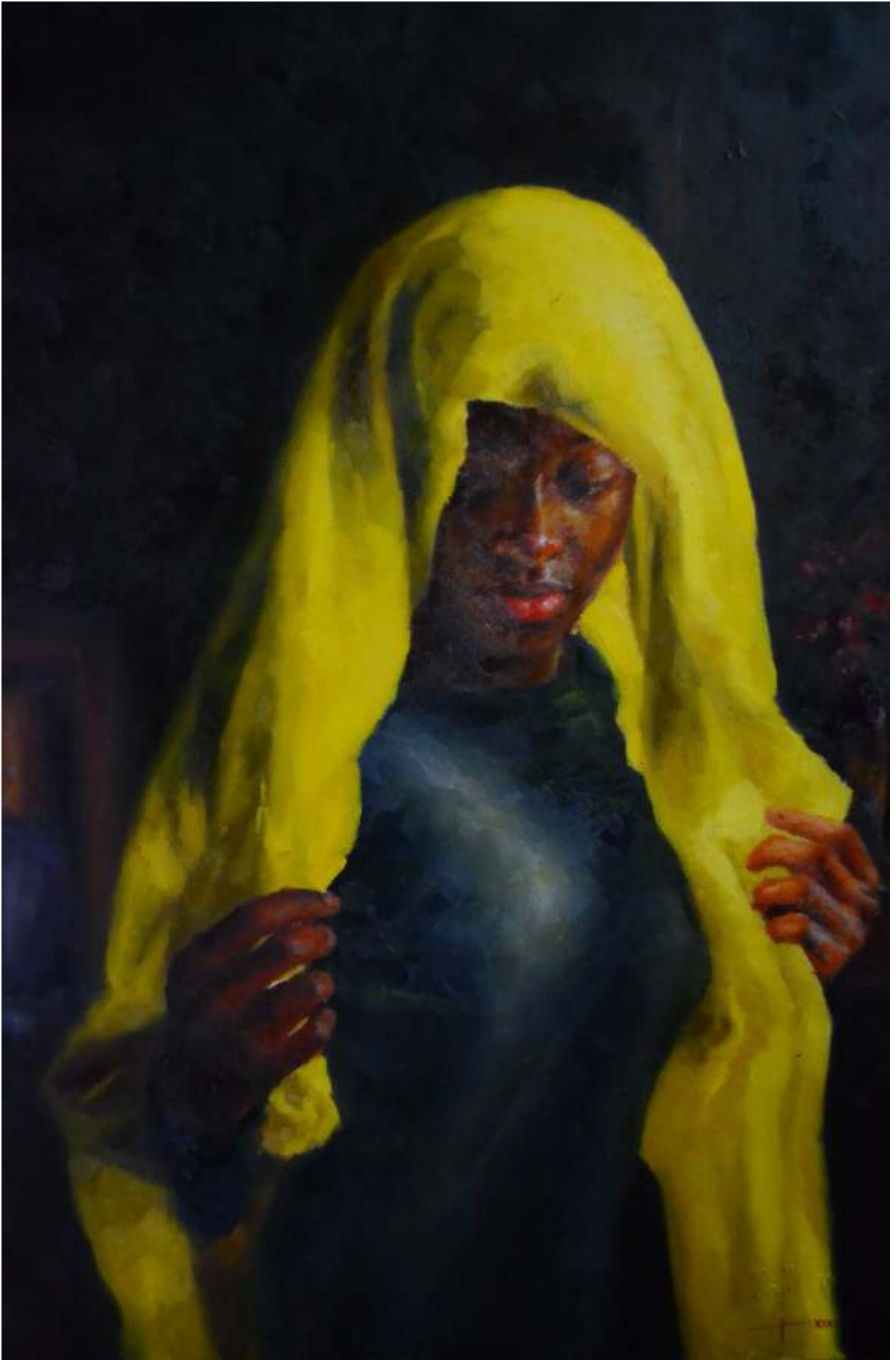
SOMETHING BRIGHT FOR THE NIGHT / Oil on canvas, 28 x 37 inches, 2019