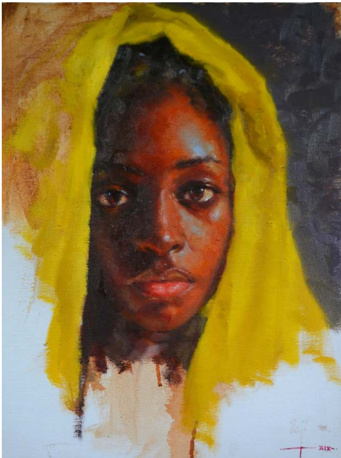
YELLOW SCARF (Study) / Oil on canvas, 17 x 22 inches, 2019