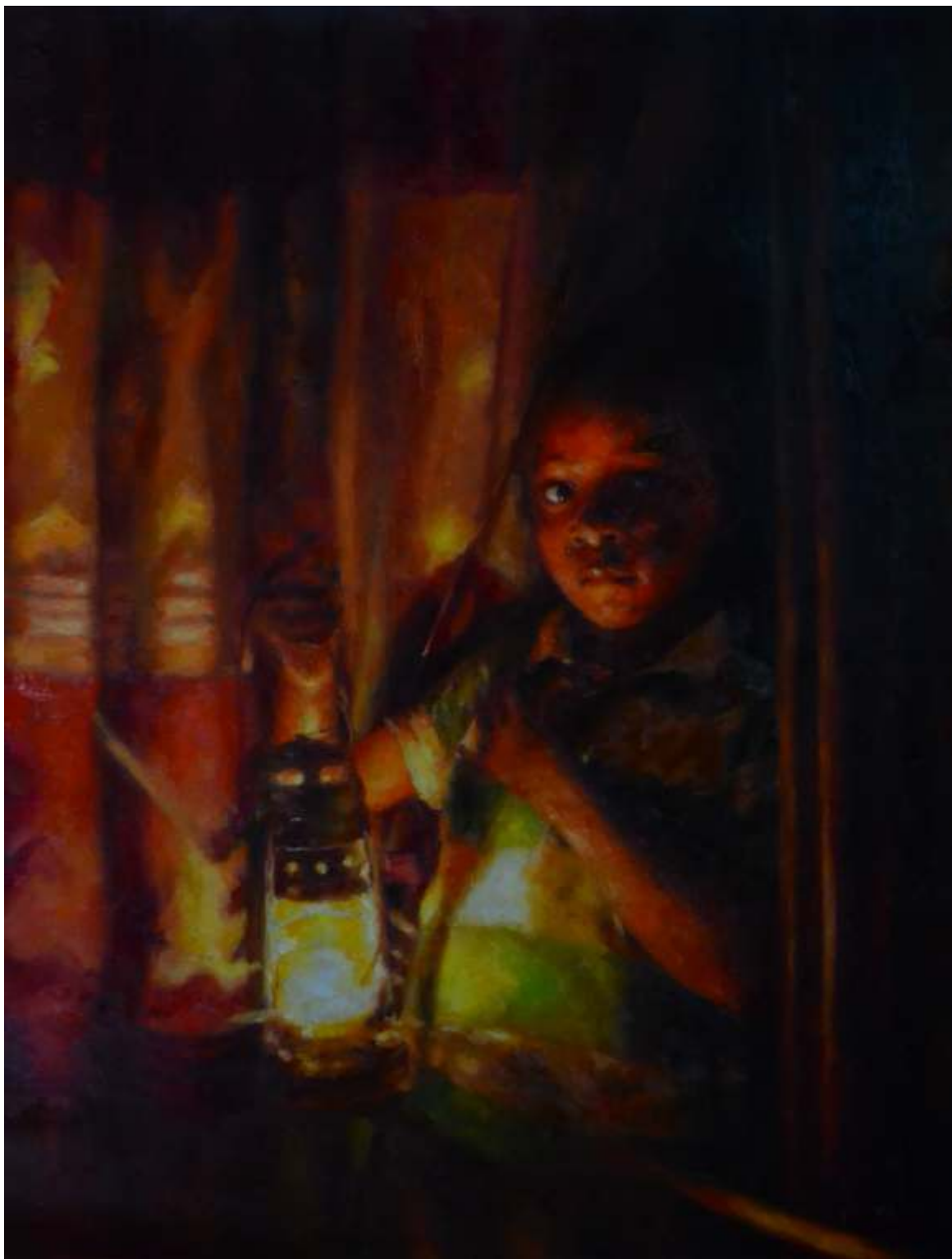
WAITING FOR YOU V / Oil on canvas, 24 x 31 inches, 2019