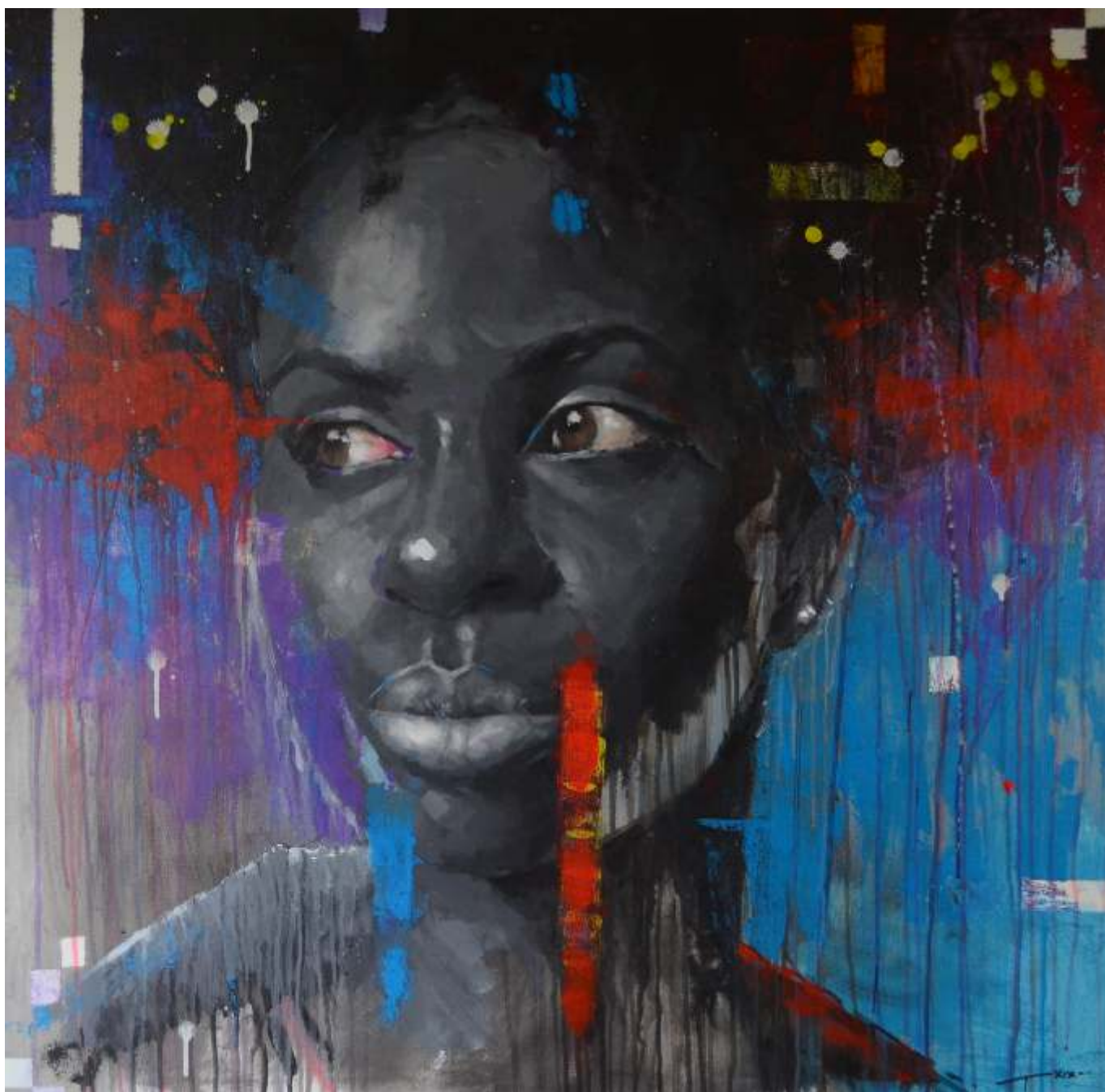
EMOTIONS / Acrylic on canvas, 36 x 36 inches, 2019