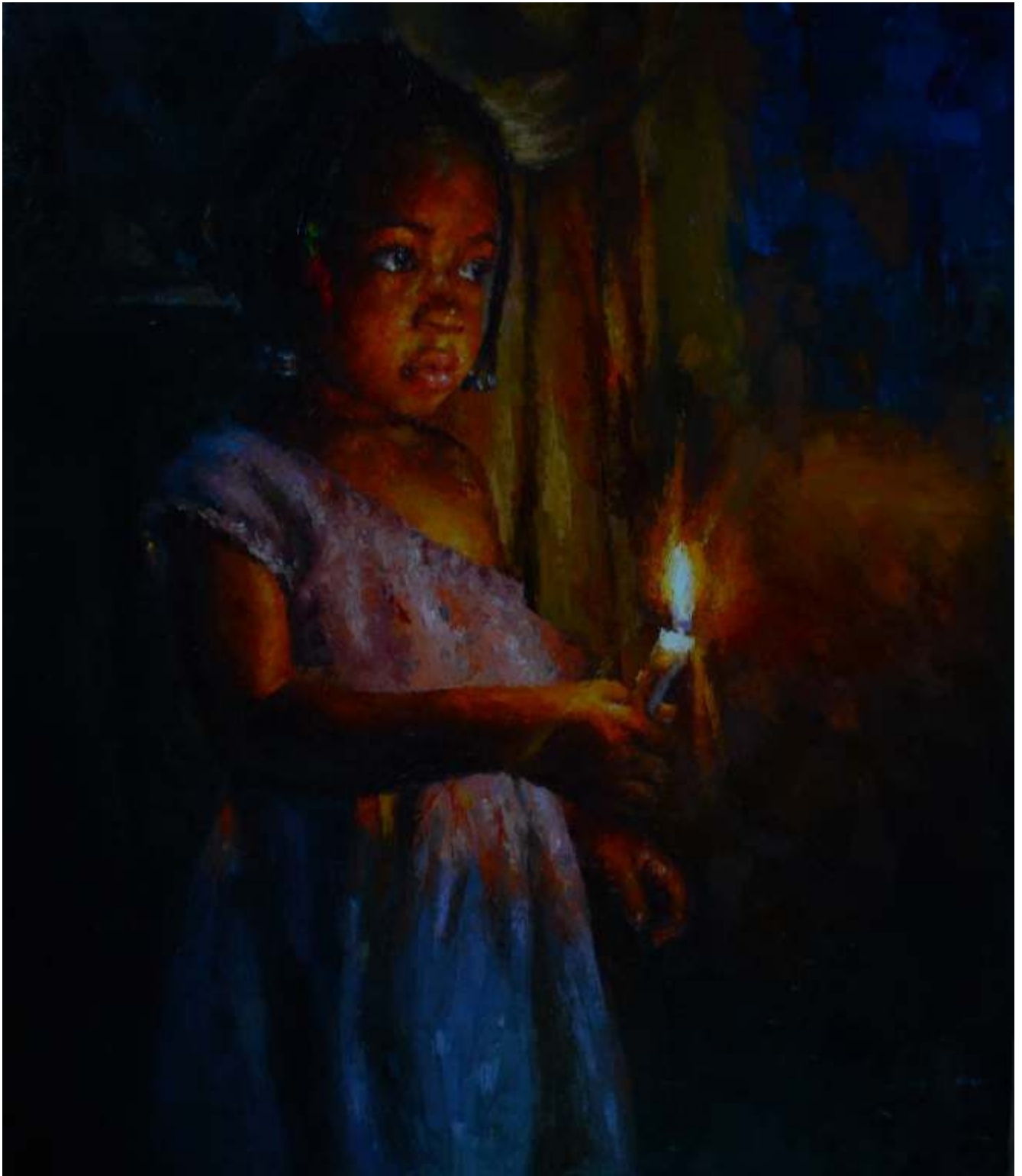
LIGHT UNTO MY PATH IV / 27 x 32 inches, Oil on canvas, 2019