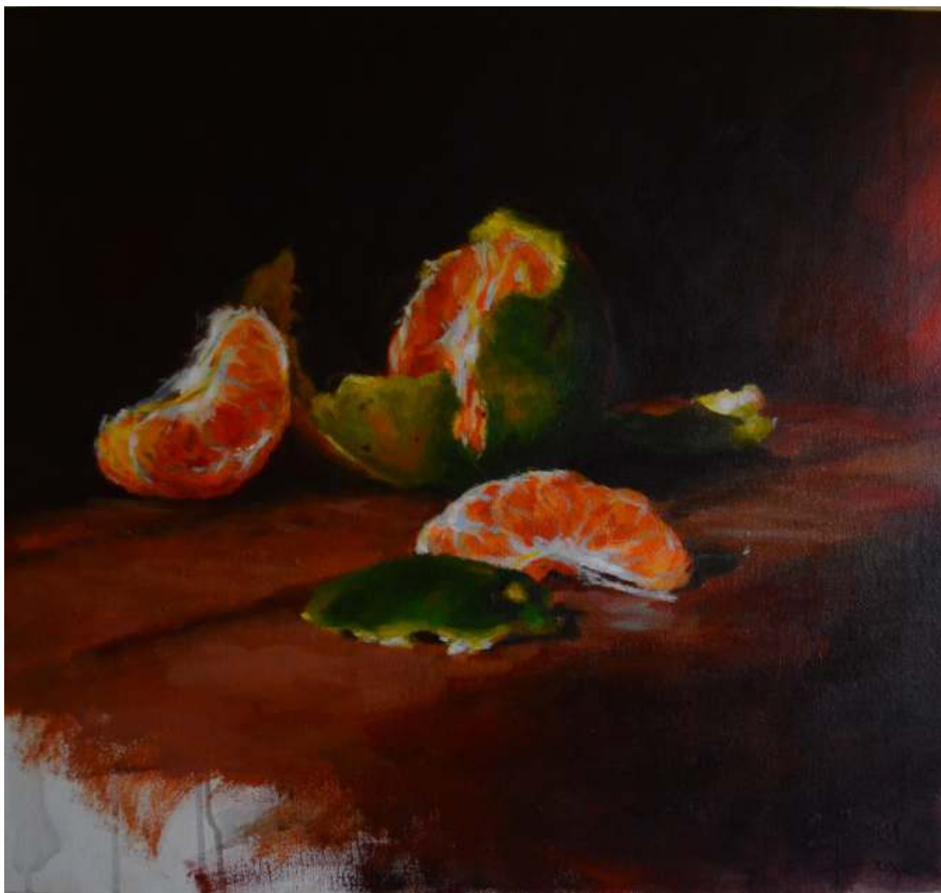
EVENING LIGHT V / Acrylic on canvas, 22 x 24 inches, 2019