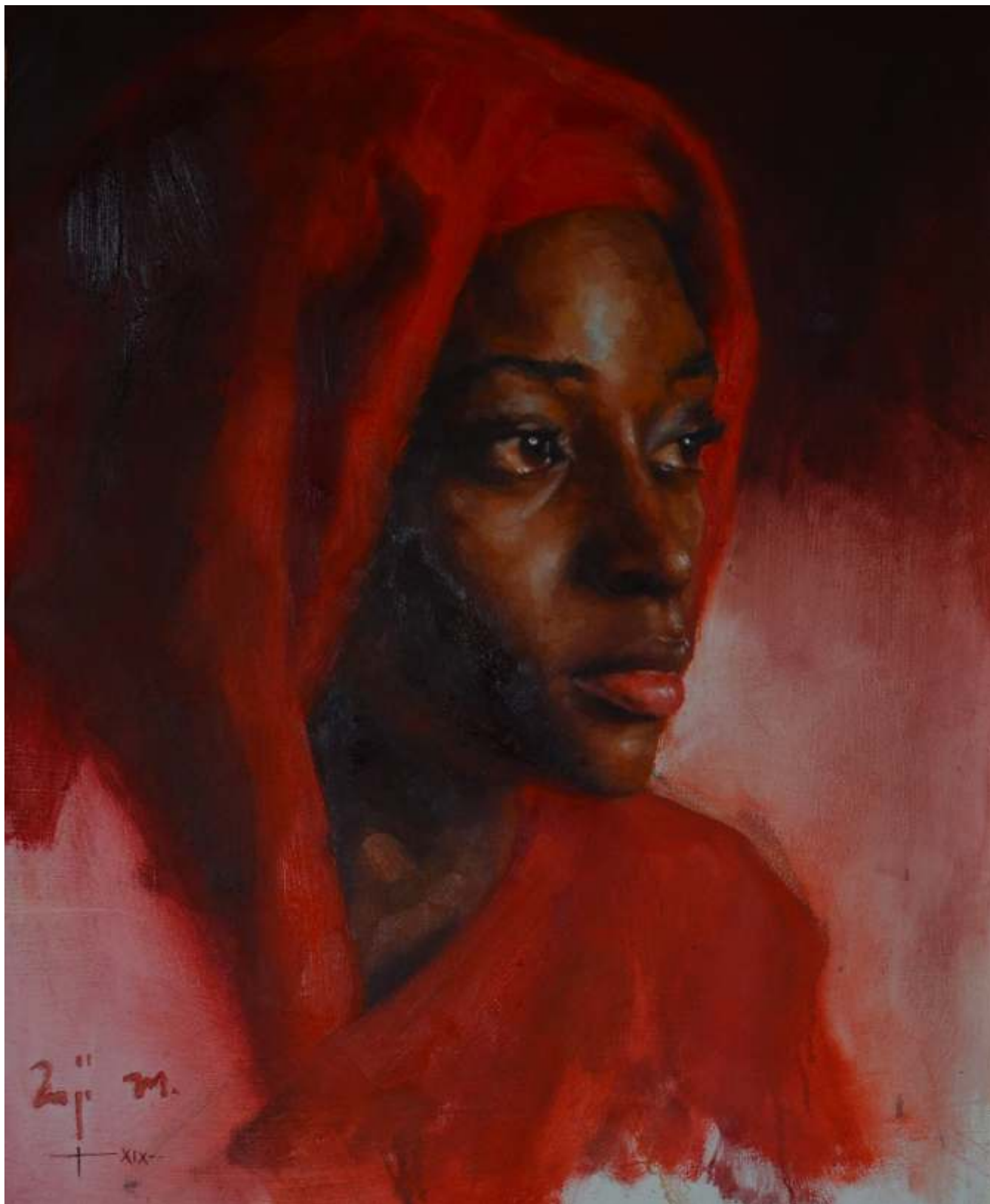
RED SCARF / Oil on canvas, 17 x 22 inches, 2019